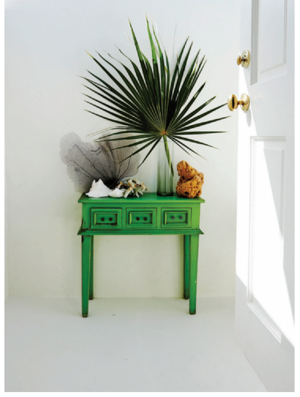
ISLAND INSPIRATIONS Kamalame Cay is accessible only by ferry from Andros Island or by seaplane from companies such as Tropic Ocean Airways. The property showcases a distinct decor that marries tropical chic with touches of whimsy.